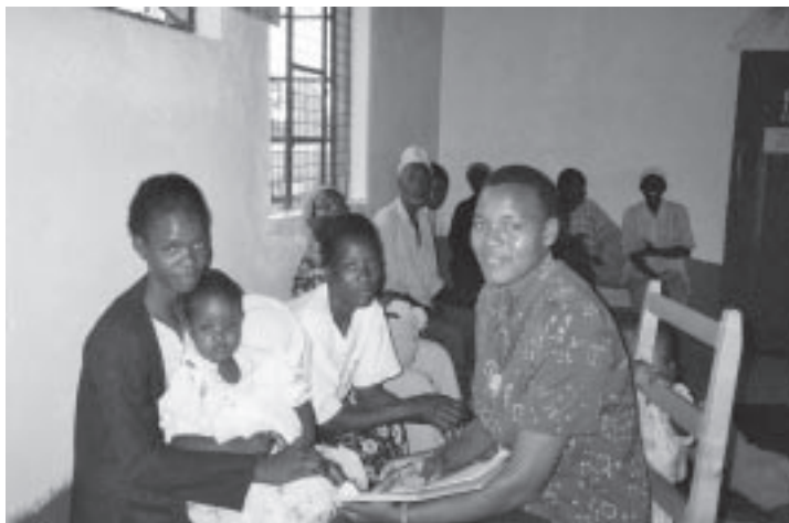
St. Julie Center, Malava Kenya - The waiting room.